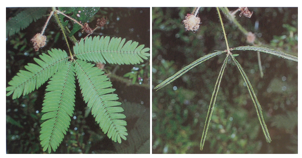
(a) The palmate-looking leaf of the sensitive (b) The same leaf closed in response to the plant before it is touched. leaflets being touched.

Uses: A tea from the leaves of this plant is drunk by women during menstruation as a contraceptive (AMP). A Doctrine of Signatures usage has been proposed noting that sometimes the leaves are placed in pillows to help people sleep (SAR). The leaves may also be powdered and used as a sleeping potion (AED). In Central America, sensitive plant has been used as a pain reliever, relaxant, diuretic, and antispasmodic (AAB). The dried leaves are also sometimes smoked to alleviate muscle spasms and backache (AAB).