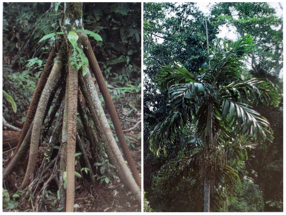
(a) Socratea exorrhiza forms a root cone of (b) The leaves, crownshaft, and flower spiny stilt roots that you can see through. branches of the stilt palm Socratea exorrhiza

Uses: Bark from the trunk is split off and used as flooring slats, walls, and dividers (AED). The spiny stilt roots are used as graters (HGB). Different tribes use a leaf brew or the roots as treatment for hepatitis (AYA, NIC).