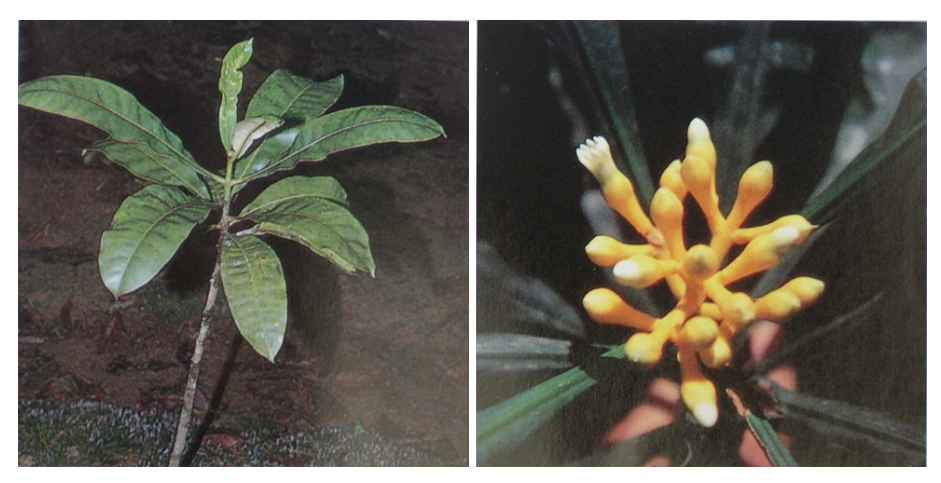
(a) Typical growth from of the snake bite (b) A cluster of flowers of the snake bite plant with leaves clustered at the top of plant. stem.

Uses: Snake bite plant is a name 'coined' by the authors due to the widespread reports in the literature of its usage in varying preparations for this purpose. The mottled patterning on the trunk of the plant suggests a Doctrine of Signatures usage (SAR). Some of the other uses of this plant are as an analgesic and to treat ophtalmia, poisoning, venomous ant stings, and the sting from the fresh-water skate (SAR). Snake bite plant is also used to treat venereal diseases (AED) and to promote the healing of cavities (RVM).