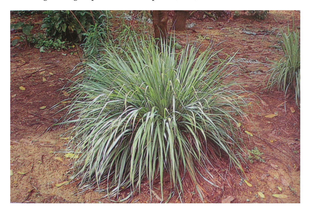
Figure 8: A typical clump of lemon grass ( Cymbopogon citratus )

Uses: Lemon grass is cultivated and used in various culinary dishes as an herb. An extract of the leaves is used in making carbonated drinks, and also as a digestive aid (AED). Amazonian Indians use the leaves in preparations to treat fever, headache, influenza, and stomachache (SAR). The roots are squeezed and the extract used to control menstrual problems (AED), and to relieve backaches and muscle spasms. Essential oils are extracted and used commercially in soaps and perfumes. Certain preparations of lemon grass are also used by some indigenous groups as a contraceptive (VDF).