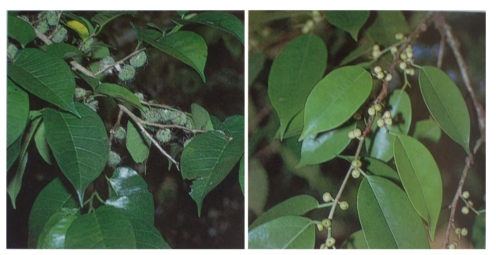
(a) Leaves and fruits of the toothache tree (b) Leaves and fruits fo the toothache tree (Maclura tinctoria). (Maclura tinctoria).

Uses: As the English common name implies, this tree is often used to treat problems associated with toothaches. Indigenous people collect the latex on 'cotton' provided by the balsa tree Ochroma pyrimidale or by kapok trees Ceiba spp., and then apply it to the infected tooth (AED). In this manner, the removal of the tooth is accomplished without pain and bleeding, but care must be exercised as this technique will evidently remove healthy teeth with equal ease (NIC). Preparations of this tree are also used as a diuretic and to treat venereal problems (AED). The AED also suggests that due to certain chemicals produced by this tree that it would serve as an astringent and antiseptic. Is is further used for cough, gout, sore throat, and rheumatism (RAR). Is is the source of an olive-colored dye, and the wood is used for lumber and in carpentry (AED).