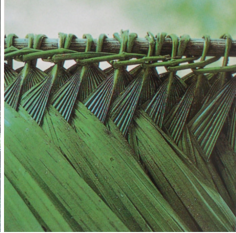
(a) The deeply split leaf of thatch palm, a (b) A section of newly-woven roof thatch or small understory palm. crisneja using thatch palm leaves