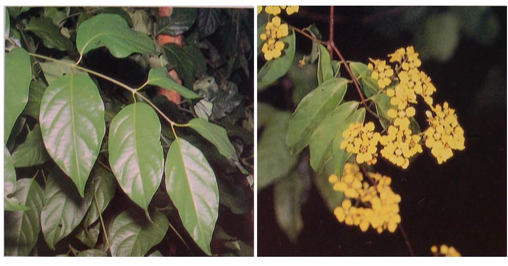
(a) Leaves of the soul vine.

Uses: The main use of soul vine is as a hallucinogenic drink ( ayahuasca ) that is made from the bark of the plant. Several other plant species are used as additives when preparing the brew. It has a long history of use and importance in various ceremonies led by tribal shamans and ayahuasqueros . Soul vine has been uses as a 'cure all' for many kinds of medical problems. It is commonly used within the Amazon regions as a laxative and emetic (AED). Shamans are believed to be able to cure various ailments through communication with the spirit world, which is reached while under the effects of the drug. Much has been written about the use of ayahuasca and its powers.